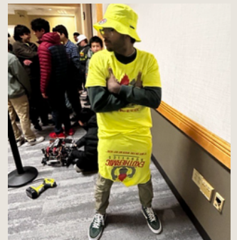
Debu, 10T, proudly showing off the diaper that he made from an exo shirt!