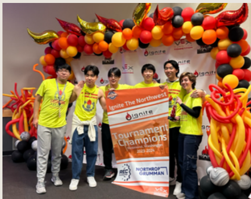
10C with their TC trophy and banner!